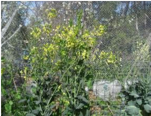
Left - Broccoli Flowered; Right - Kale Flowered