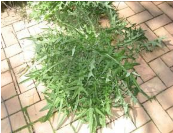
Left - Spring Onions Flowered; Right - Thistle