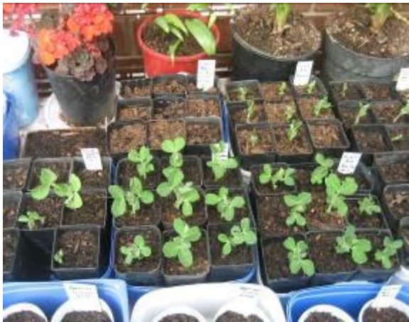
Left - Newly Germinated Tomato Seedlings; Right - Late Sowing of Peas Germinated