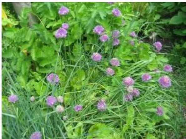
Left - Silver Beet Flowered; Right - Chives Flowered