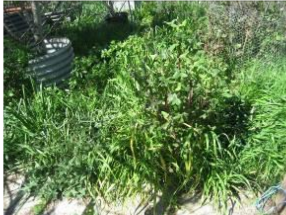
Left - Garlic; Right - Weeds