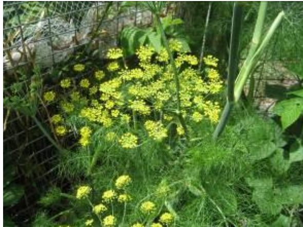
Left - Purple Podded Peas Flowered; Right - Fennel Flowered