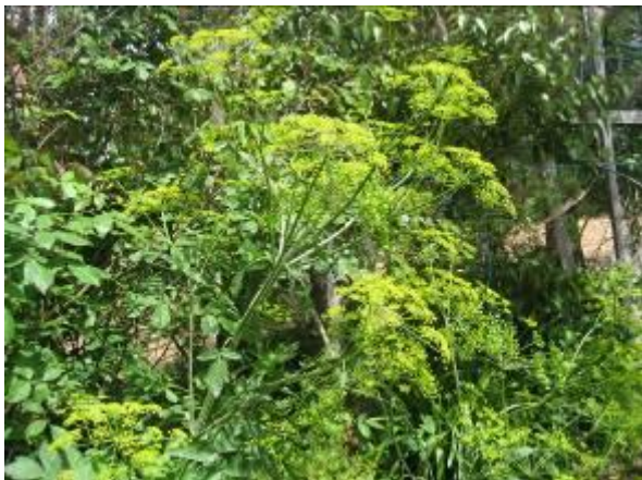
Left - Banana Passionfruit Ripened; Right - Parsnips Flowered