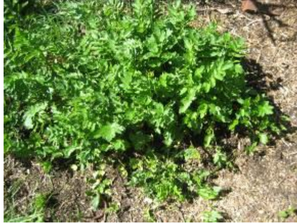
Left - Fennel Seedlings; Right - Parsnip Seedlings