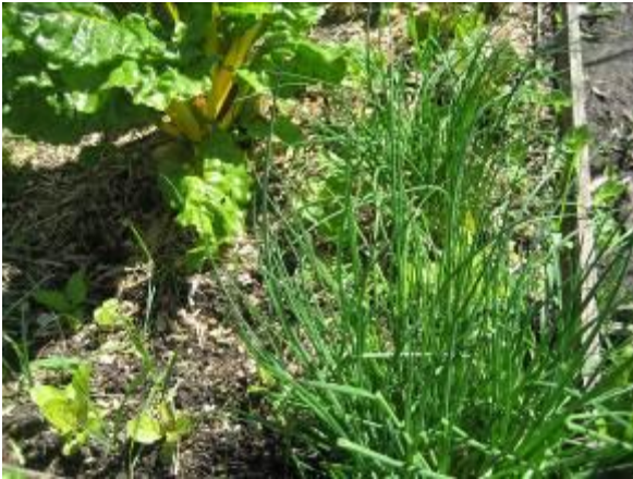
Left - Freckle Lettuces; Right - Chives