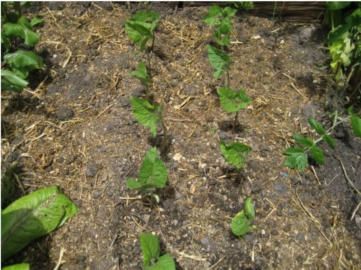
Above - Beans Germinated