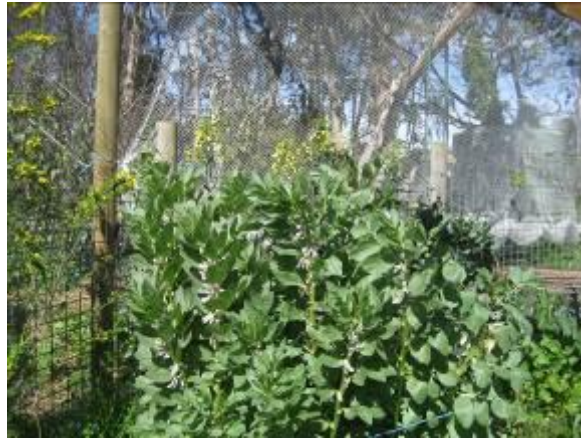
Left - Peas Flowering; Right - Broad Beans Flowering